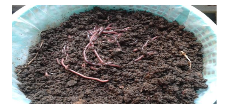
Figure.3 Process of Paddy Straw Composting for 40 Days

Figure.2 Earthworm ( Eisenia foetida ) used for Vermicompost Production