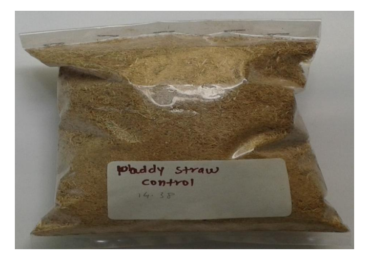
Figure.1 Paddy Straw Initial Sample

Note: All values are mean and standard deviation of three replicates (M±SD)